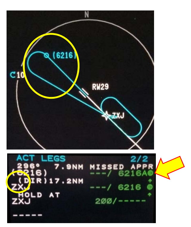
Figure 2b. After the crew uses the left FMS to activate Temperature Compensation, the "R" turn to ZXJ is initially removed (blanked) on the right FMS and will subsequently be removed on both FMSs. The map display may differ from this example.

In a single FMS installation, activating Temperature Compensation does not immediately remove the turn direction. Instead, the turn direction is removed if the crew subsequently reselects the same approach.