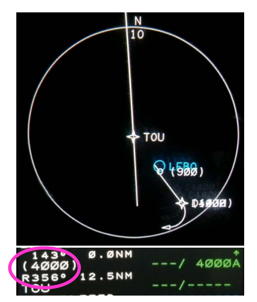
Figure 3a. "Climb to 4000 feet followed immediate by Right turn 356° course to TOU.