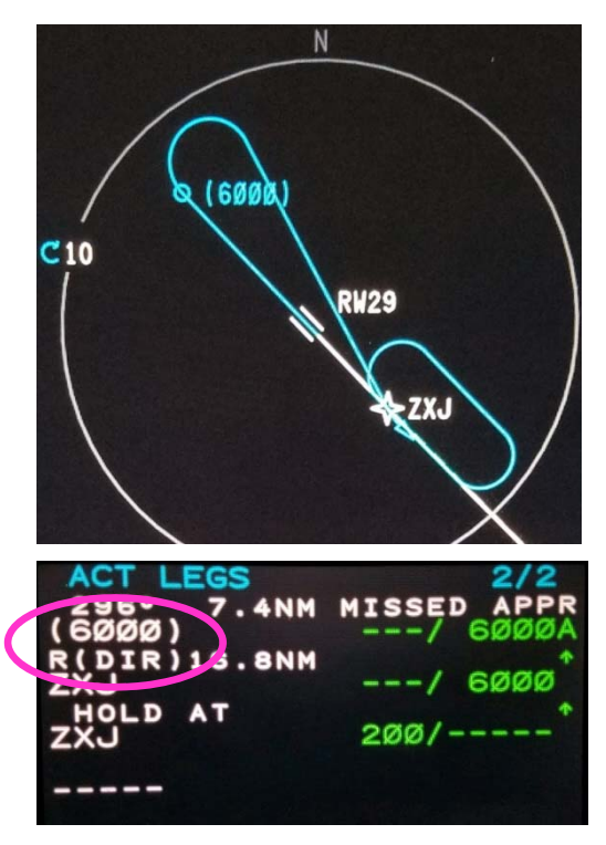
Figure 2a. "Climb to 6000 feet followed immediate by Right turn Direct-to ZXJ.