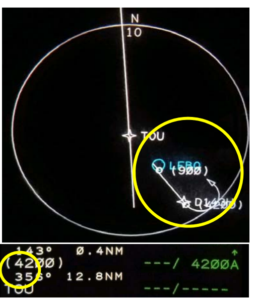
Figure 3b. After manually entering 4200A (in places of 4000A), the "R" turn direction is removed and the FMS computes the shortest turn direction, left in this case.