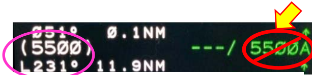
Figure 1a. “Climb to” 5500 feet then Left turn to 231° Course to Fix. (Fix is not shown.)