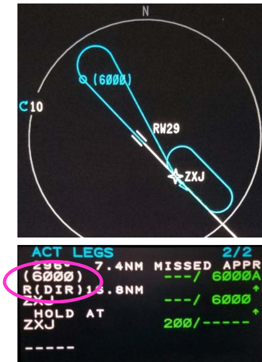
Figure 2a. "Climb to 6000 feet followed immediate by Right turn Direct-to ZXJ.