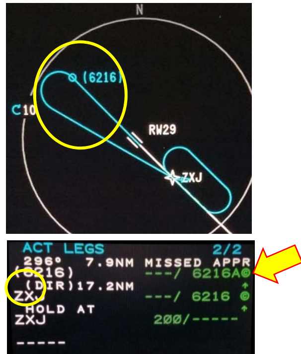
Figure 2b. After the crew uses the left FMS to activate Temperature Compensation, the "R" turn to ZXJ is initially removed (blacked) on the right FMS and will subsequently be removed on both FMSs. The map display may differ from this example.

In a single FMS installation, activating Temperature Compensation does not immediately remove the turn direction. Instead, the turn direction is removed if the crew subsequently reselects the same approach.