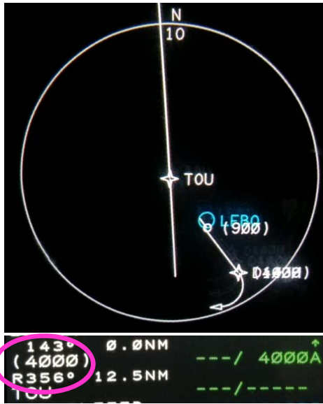
Figure 3a. "Climb to 4000 feet followed immediate by Right turn 356° course to TOU.