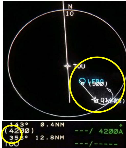
Figure 3b. After manually entering 4200A (in places of 4000A), the "R" turn direction is removed and the FMS computes the shortest turn direction, left in this case.