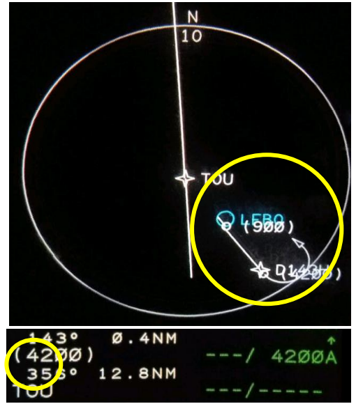
Figure 3b. After manually entering 4200A (in places of 4000A), the "R" turn direction is removed and the FMS computes the shortest turn direction, left in this case.