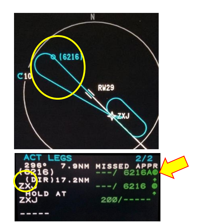
Figure 2b. After the crew uses the left FMS to activate Temperature Compensation, the "R" turn to ZXJ is initially removed (blanked) on the right FMS and will subsequently be removed on both FMSs. The map display may differ from this example.

In a single FMS installation, activating Temperature Compensation does not immediately remove the turn direction. Instead, the turn direction is removed if the crew subsequently reselects the same approach.