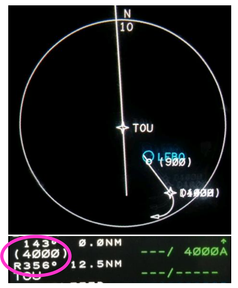
Figure 3a. "Climb to 4000 feet followed immediate by Right turn 356° course to TOU.