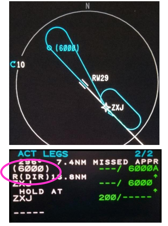
Figure 2a. "Climb to 6000 feet followed immediate by Right turn Direct-to ZXJ.

Figure 2b shows that after the crew activates Temperature Compensation, the turn direction is removed, initially on the "non-edit-side FMS" in a dual/triple FMS installation. In other words, if the pilot-not-flying (non-coupled side) makes the edit, the turn direction is initially removed on the pilot-flying (coupled) side. After the active TO waypoint sequences, the turn direction will be removed on both FMSs.